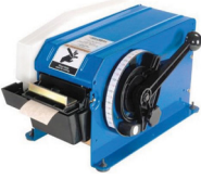
GUMDISP404 Semi Automatic Water Activated Tape Dispenser Takes up to 75mm width