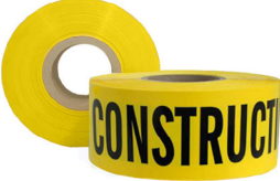
B3100 Custom Printed Barrier Tape (1 Colour Print) 75/100mm x 300m