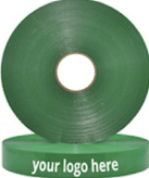
SCM Custom Printed Machine Carton Sealing Tape (Up to 3 Colours) 24/36/48mm x 1000m