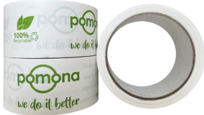
GP04WP Custom Printed Water Activated Gum Paper Tape - 100% Recyclable 36/48/72mm x 50m