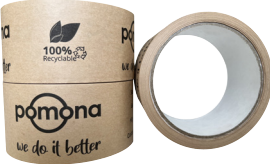
GP04BP Custom Printed Water Activated Gum Paper Tape - 100% Recyclable 36/48/72mm x 50m

Dispenser required for Water Activated Tapes - See below.