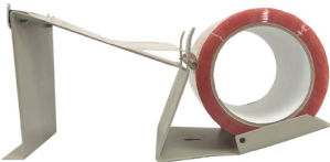
S8988 Lope on A Roll Dispenser Used in conjunction with the S624 and S624ECO