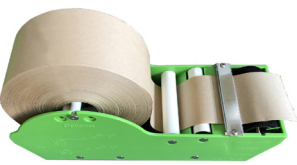
GUMDISP1 Gum Paper Tape Dispenser Takes up to 75mm width