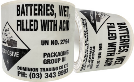
S4040 Custom Printed Labels on a Roll 48/72/96/144mm x 100m Rolls of 333/400/500/660 labels