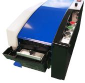
GUMDISP504 Automatic Water Activated Tape Dispenser Takes up to 75mm width