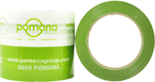
SCUSTOM Custom Printed Packaging Tape (Up to 3 Colours) 24/36/48/72mm x 100m