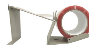
S8988 Lope on A Roll Dispenser Used in conjunction with the S624 and S624ECO