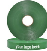
SCM Custom Printed Machine Carton Sealing Tape (Up to 3 Colours) 24/36/48mm x 1000m