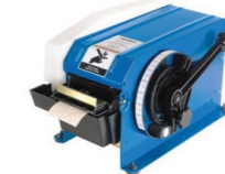
GUMDISP404 Semi Automatic Water Activated Tape Dispenser Takes up to 75mm width