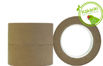
ECOPACK15 / W15 Paper Packaging Tape 24/36/48mm x 50m