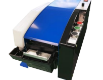
GUMDISP504 Automatic Water Activated Tape Dispenser Takes up to 75mm width