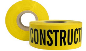
B3100 Custom Printed Barrier Tape (1 Colour Print) 75/100mm x 300m