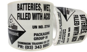
S4340 Custom Printed PET Labels on a Roll 48/72/96/144mm x 100m Rolls of 333/400/500/660 labels