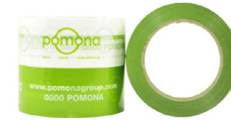
SCUSTOM Custom Printed Packaging Tape (Up to 3 Colours) 24/36/48/72mm x 100m