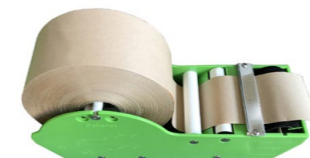
GUMDISP1 Gum Paper Tape Dispenser Takes up to 75mm width