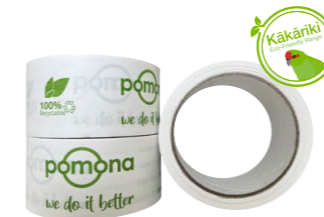
GP04WP Custom Printed Water Activated Gum Paper Tape - 100% Recyclable 36/48/72mm x 50m