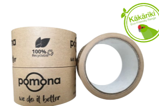
GP04BP Custom Printed Water Activated Gum Paper Tape - 100% Recyclable 36/48/72mm x 50m