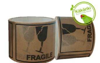
ECOPACK15FRAGILE Paper Labels on a Roll 72mm x 100mm (500 labels)

Dispenser required for Water Activated Tapes - See below.